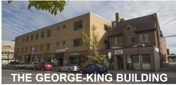
THE GEORGE-KING BUILDING