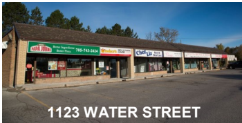
1123 WATER STREET

Space available on The Queensway and The Kingsway; near Highway 115, a primary route into the city. From 2,000 to 23,000 square feet of warehouse space, or up to 1,200 square feet of second floor office space.