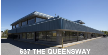
637 THE QUEENSWAY

Leasing opportunities from 300 square feet, up to 2,300 square feet available; locations close to restaurants, shopping, and banking.