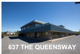
637 THE QUEENSWAY

Approx. 2,100 square feet of second floor office/industrial space available on The Queensway; easy access to Hwy 115, close to Lansdowne Place Shopping Centre and on-site parking.